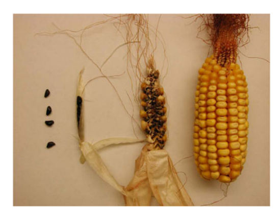
Fig. 1. From left to right, teosinte ( Zea mays ssp. mexicana) fruits, teosinte infructescence, F<sub>1</sub> hybrid infructescence, and maize ( Zea mays ssp. mays) infructescence.